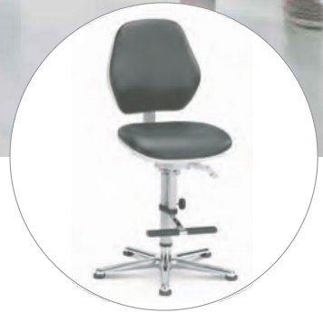
Cleanroom Basic Stool 9141E