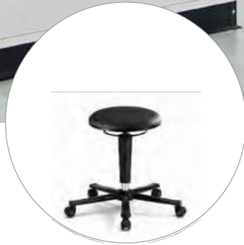
Cleanroom Basic Stool 9468R